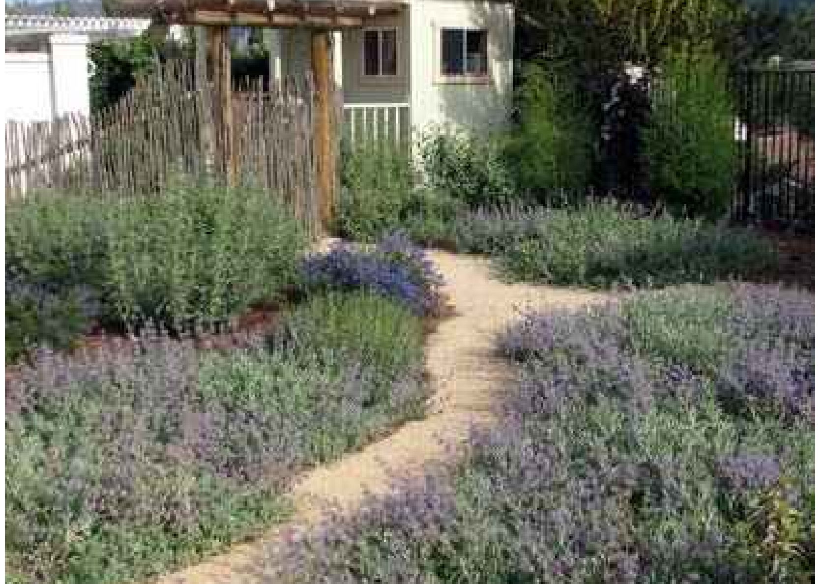
PATHWAY WITH SALVIA GROUNDCOVER